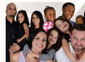
Family coaching that ties generations, ethnicities, and resources.

Coop Di Leu is concerned and committed to service for underrepresented families and their members. Our engagements run from literacy series to personal coaching and family support. Specialization in identity constructs and counseling psychology makes experiences with our staff both fun and empowering.