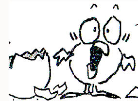
CDL workshops empower clients to "see beyond the shell" in transformative and sustainable ways.

INSTITUTION SERVICES: FROM $350.00/HR Direct engagement via workshops, climate research, audits, and residency is how Coop Di Leu completes its mission. Clients learn first-hand how to complete large and small scale diversity initiatives, and they learn core principles and structures that give greater returns on their investments. Workshops and retreats are half and full days. Climate work varies by breath. Residencies are several days to beyond a year.