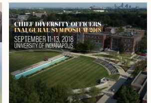
Inaugural Symposium 2018

INSTITUTION SERVICES: FROM $350.00/HR Direct engagement via workshops, climate research, audits, and residency is how Coop Di Leu completes its mission. Clients learn first-hand how to complete large and small scale diversity initiatives, and they learn core principles and structures that give greater returns on their investments. Workshops and retreats are half and full days. Climate work varies by breath. Residencies are several days to beyond a year.