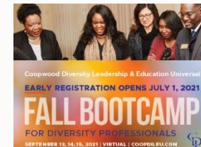
Annual fall virtual Bootcamp

NATIONAL TRAININGS: FROM $325.00/EA Bringing diversity professionals together is core to the Coop Di Leu mission. We've proudly drawn hundreds of inspiring, emerging, and advanced diversity professionals to host institutions in Washington DC, Indiana, Pennsylvania, Oregon, New Jersey, and North Carolina. Each experience is designed to expose participants to transformative skillsets, expert advisors, and safe practice with the more challenging aspects of diversity work.